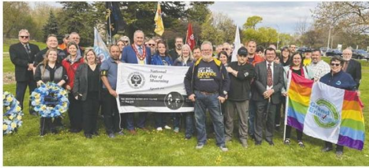
A large crowd of people gathered at Lorne Park on Tuesday (April 28) for the annual Day of Mourning ceremony. The ceremony honours those who have died as a result of workplace injury or illness. VINCENT BALL

Guest said the best way to honour the fallen is to continue to demand safe workplaces, stronger protections and real accountability from those who put profit ahead of people.